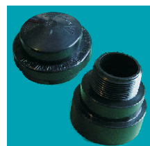
SOLVENT WELD WITH ADAPTER