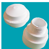
SOLVENT WELD WITH ADAPTER