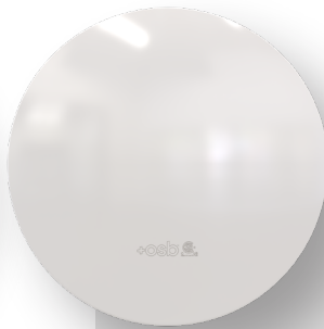
W - White / Blanc