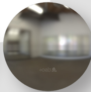
POLN - Polished Nickel / Nickel poli