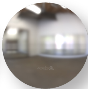
BCP - Brass Chrome Plated / Laiton Chrome CP - Chrome Plated / Chrome