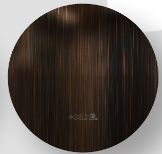
VB - Venetian Bronze / Bronze Vénitien