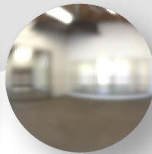
SS - Stainless Steel / Acier inoxydable