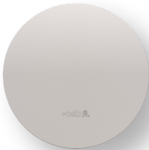
MW - Matte White / Blanc mat