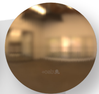
LB - Luxe Bronze / Luxe Bronze