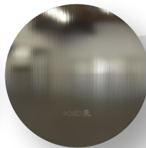
BN - Brushed Nickel / Nickel brossé