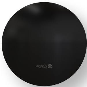
MB - Matte Black / Noir mat