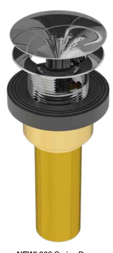
NEW! 302 Series Brass Low profile model. Accepts a 1-1/2" T.O.E. Tube (included). Clicker® model shown