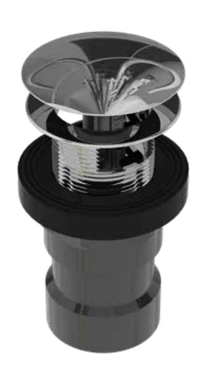
600 Series ABS Features an 1-1/2" ABS/ DWV Hub. Clicker® model shown.