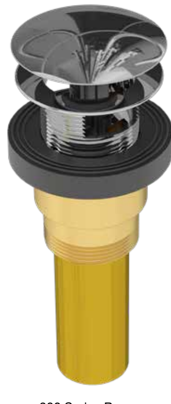
300 Series Brass Accepts a 1-1/2" T.O.E. Tube (included), Flanged Tailpiece w/Nut and Washer, or a Copper DWV Tailpiece (Solder connection). Clicker® model shown.